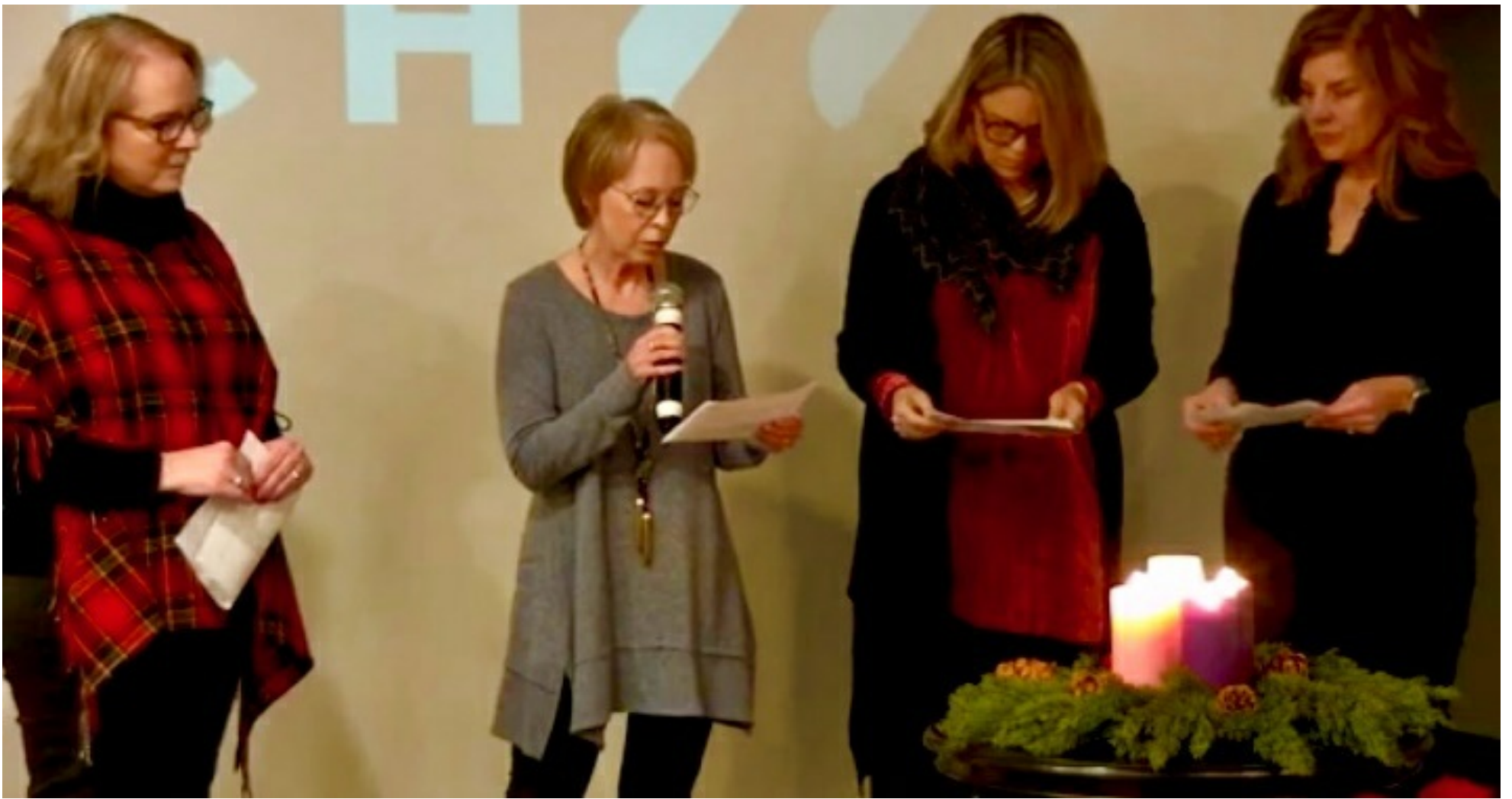
The Literacy for Life Team lighting the Christ candle on Christmas Eve.